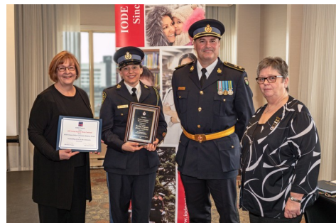
2019 IODE Police Community Relations Recipient

Mail to: 45 Frid Street, Suite 9, Hamilton, ON L8P 4M3