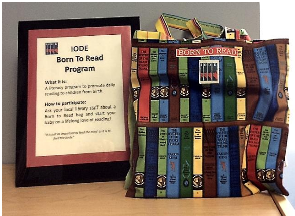
Bemersyde Book Bags