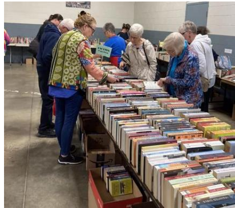
Confederation Chapter, Ridgetown Book Sale