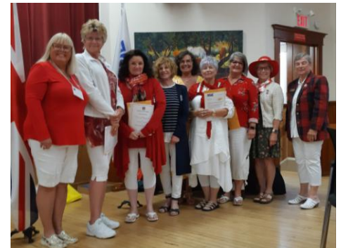
Five Year Service Awards, names below